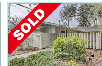
351 Greenwood Garden Golf View, 3 BR 2 BA Sea Pines | $449,000