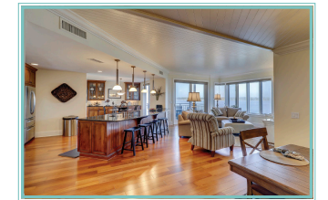
1921 S. Beach Club Villas Ocean View, 3 BR 2.5 BA Sea Pines | $1,175,000