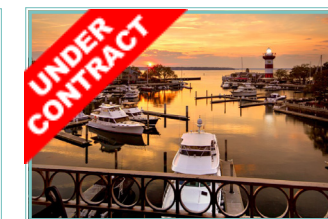
847 Ketch Court Villas Harbour View, Studio Penthouse Sea Pines | $239,000