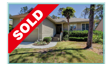
151 Otter Road Wooded View, 4 BR 3 BA Sea Pines | $499,000

VISIT OUR NEW WEBSITE www.HermanandDavisProperties.com