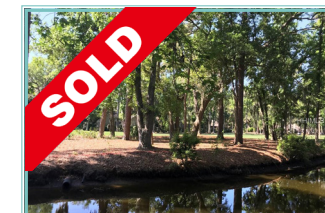
7 Isle of Pines Drive Golf View, 3 BR 2 BA Sea Pines | $449,000