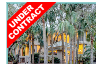
24 Surf Scoter Road 2nd Row, 4 BR 4.5 BA Sea Pines | $2,225,000