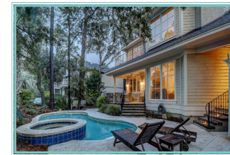
12 Piping Plover Road 2nd Row, 4 BR 4 BA Sea Pines | $2,710,000