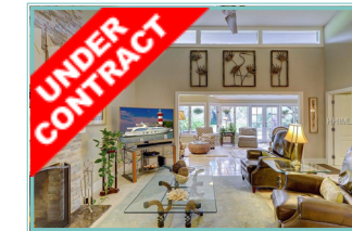
328 Greenwood Garden Golf View, 3 BR 2 BA Sea Pines | $595,000