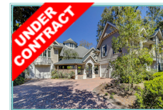
13 Marsh Drive Marsh/Golf View, 6 BR 6.5 BA Sea Pines | $3,210,000