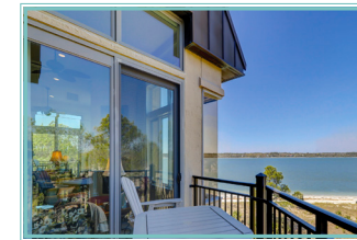
1936 S. Beach Club Villas Ocean View, 4 BR 4.5 BA Sea Pines | $1,649,000