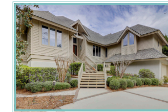
27 Long Marsh Lane Marsh View, 4 BR 3.5 BA Sea Pines | $1,299,000